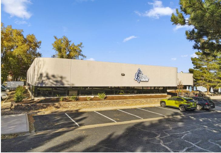
Ken Caryl Business Park

Location: 10577 W Centennial Rd Littleton, CO 80127 Building Size: 30,656 sq ft Available: 14,357 sq ft (West Wing) Lot Size: 2.05 Acres Year: 1981 Lease Rate: $10.00 - $12.00 psf NNN CAM Fees: $5.85 psf Power: 1,600 AMP/480 Volt Sale Price: $5,250,000.00