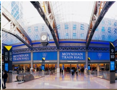
Moynihan Train Hall