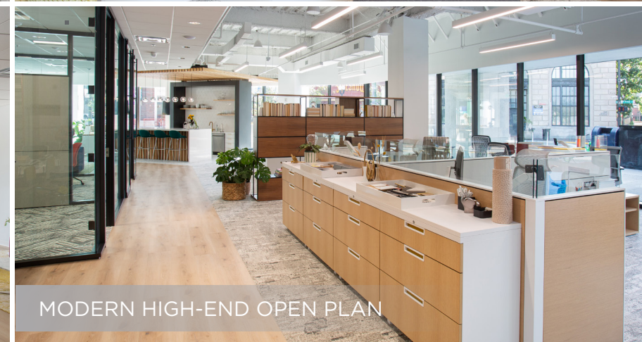
MODERN HIGH-END OPEN PLAN