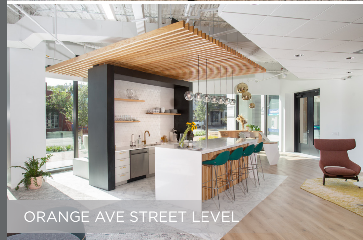
ORANGE AVE STREET LEVEL