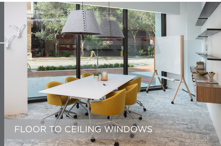
FLOOR TO CEILING WINDOWS