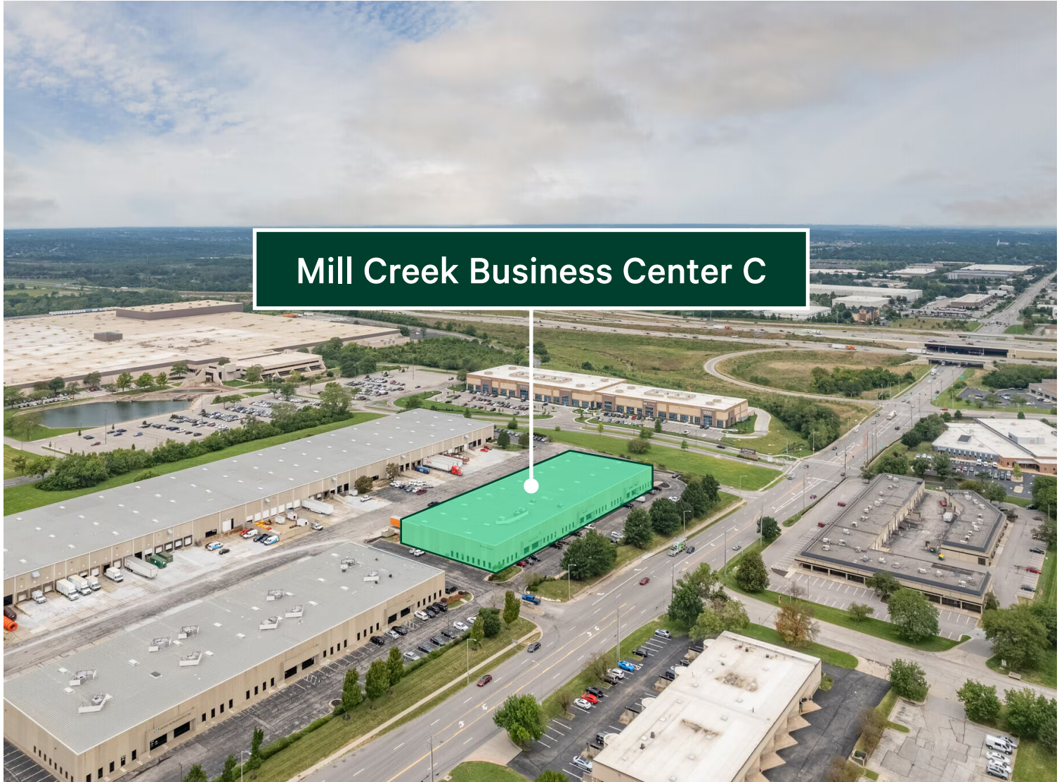
Mill Creek Business Center C