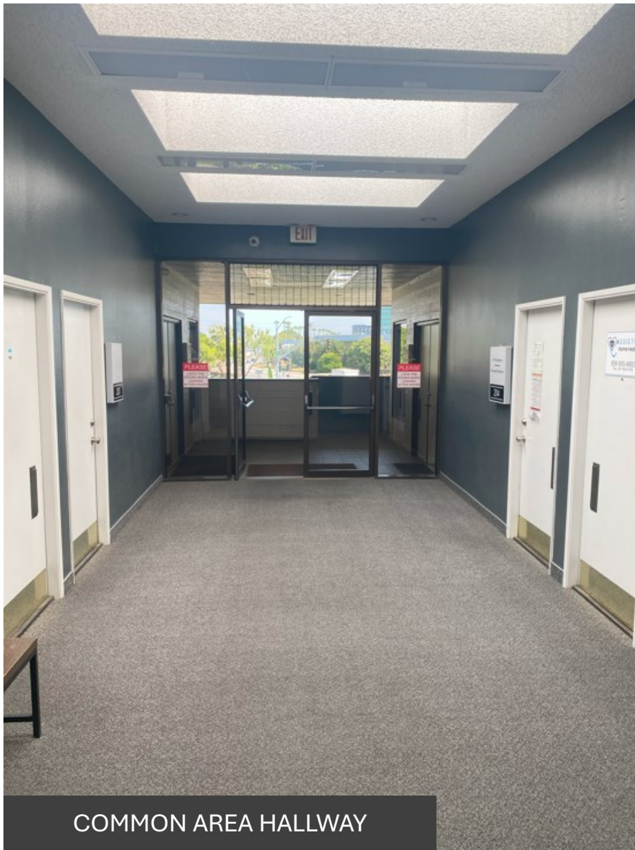
COMMON AREA HALLWAY