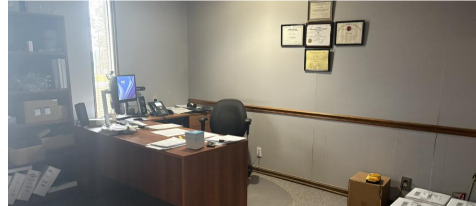
Private offices for administrative and dispatch functions