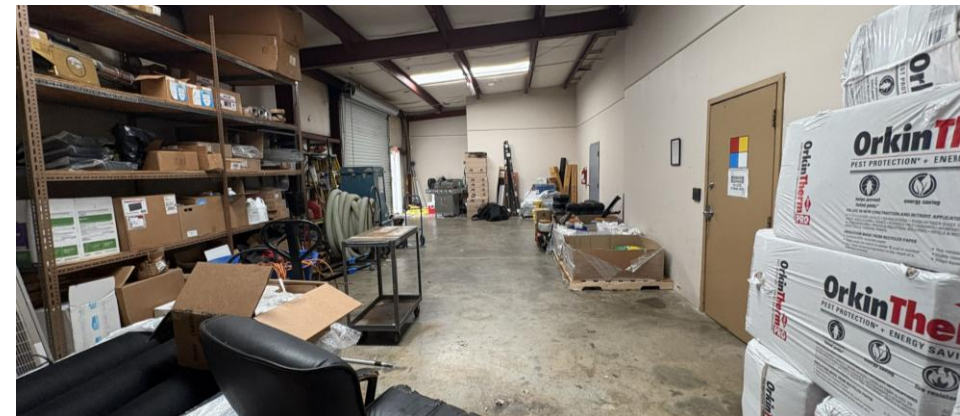
Warehouse with shelving and service workflow layout