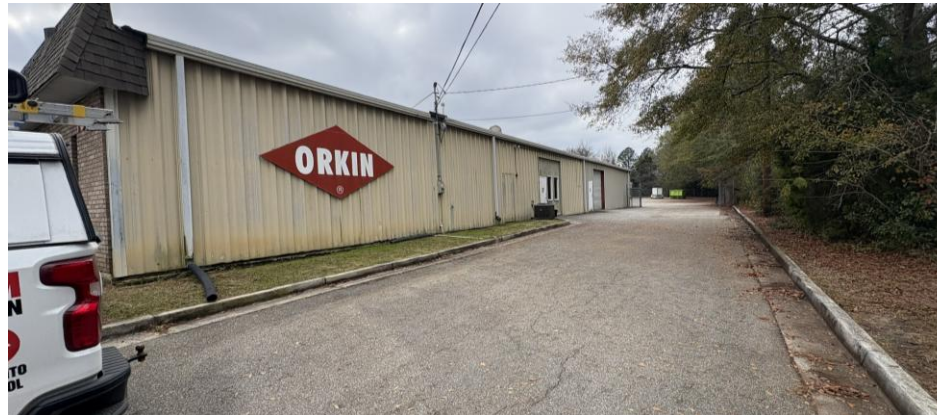
Employee Parking Entrance