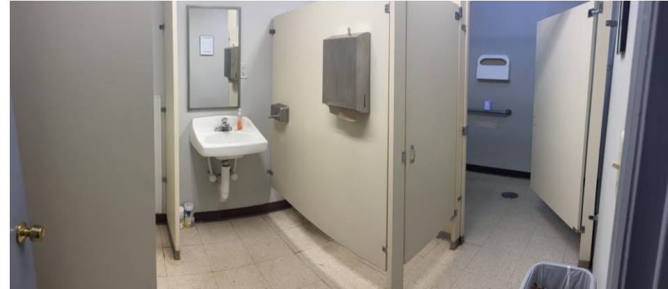
Ladies Rest Room