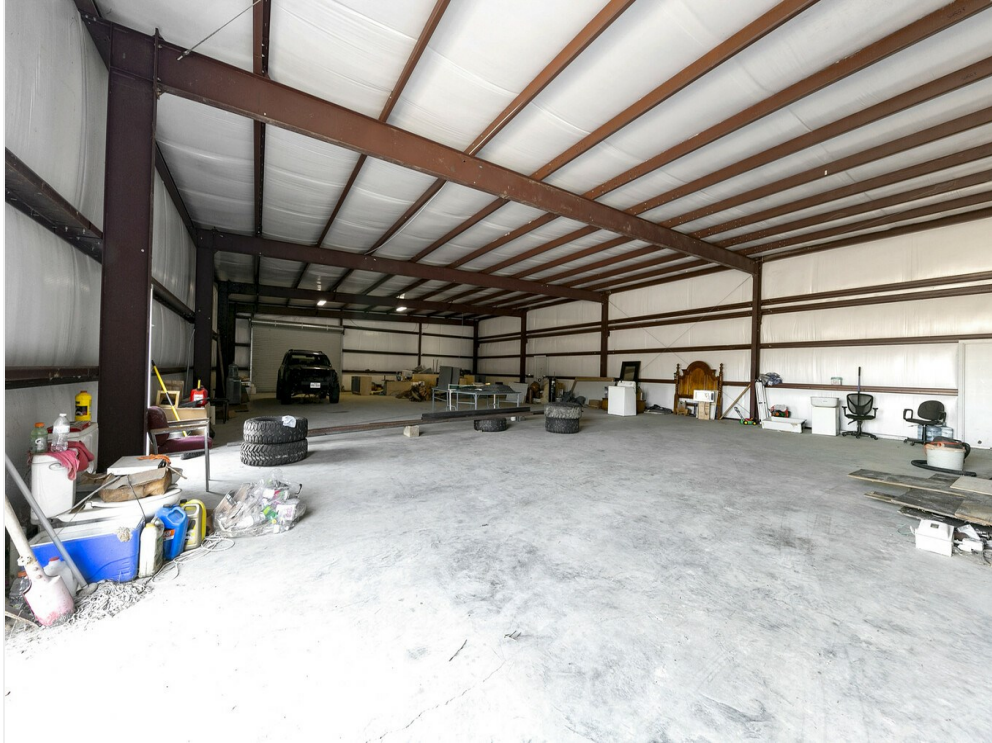
17175 highway 242-06