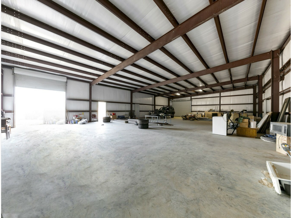
17175 highway 242-05