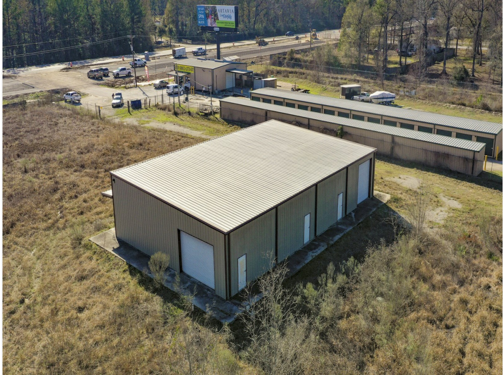
17175 highway 242-13