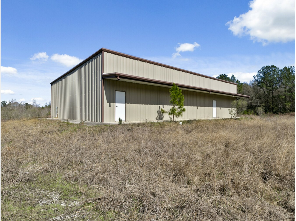
17175 highway 242-02