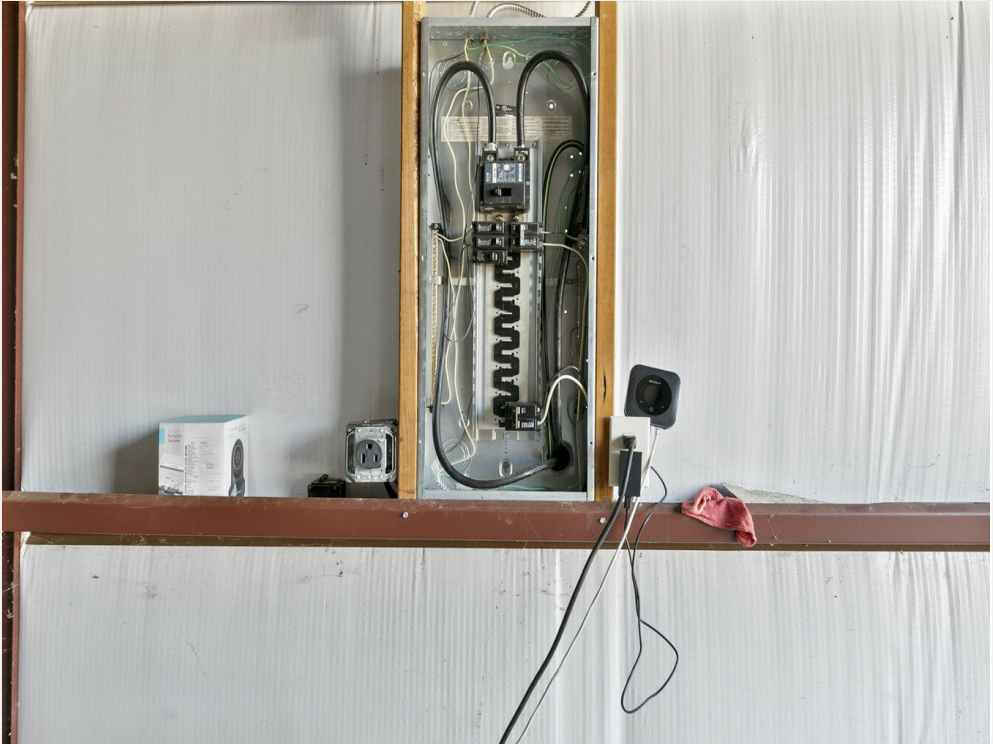
17175 highway 242-10