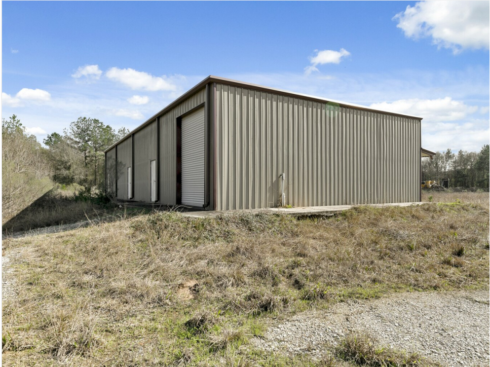
17175 highway 242-03