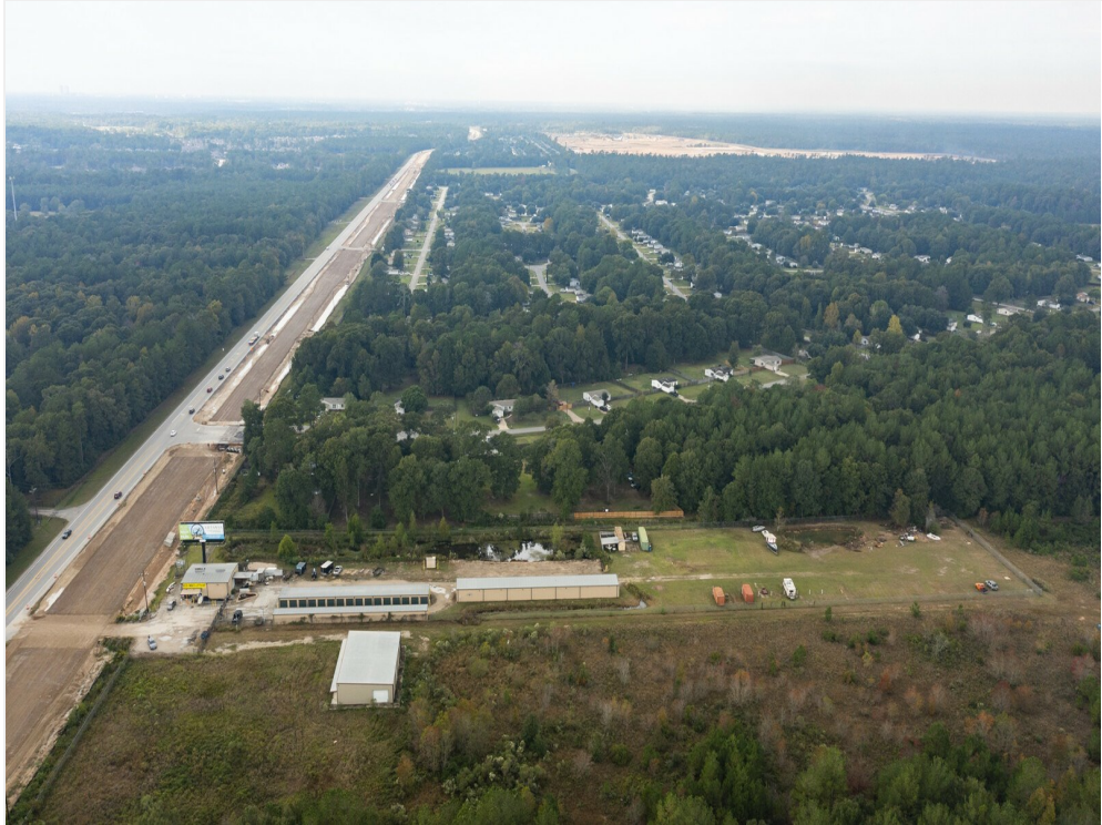
17111 Highway 242-04