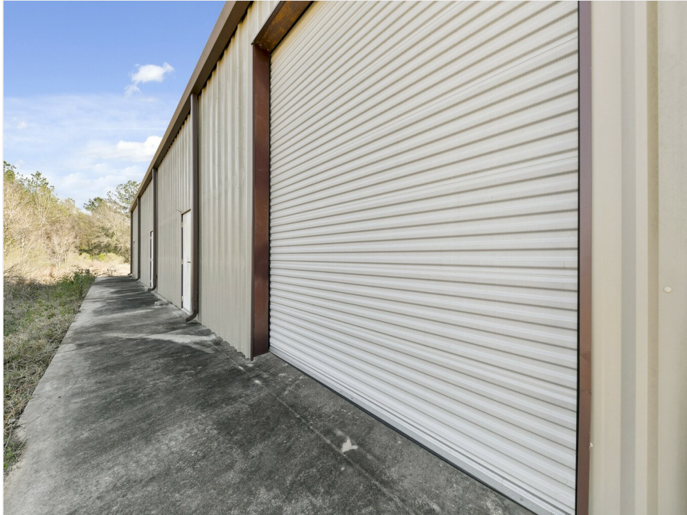
17175 highway 242-04