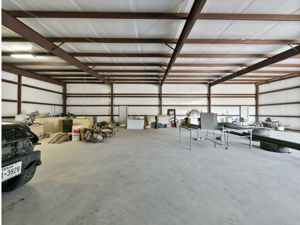
17175 highway 242-09