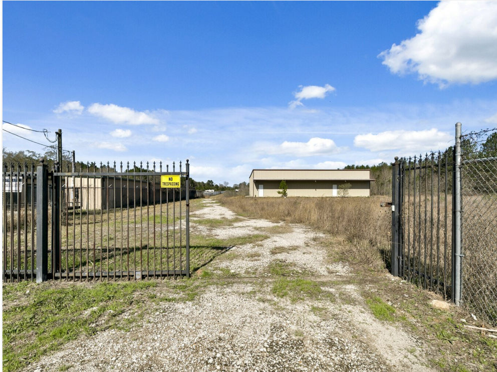
17175 highway 242-01