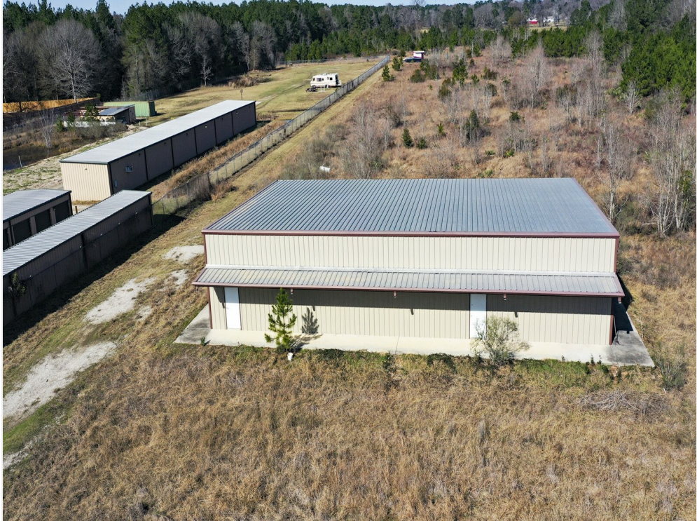
17175 highway 242-11