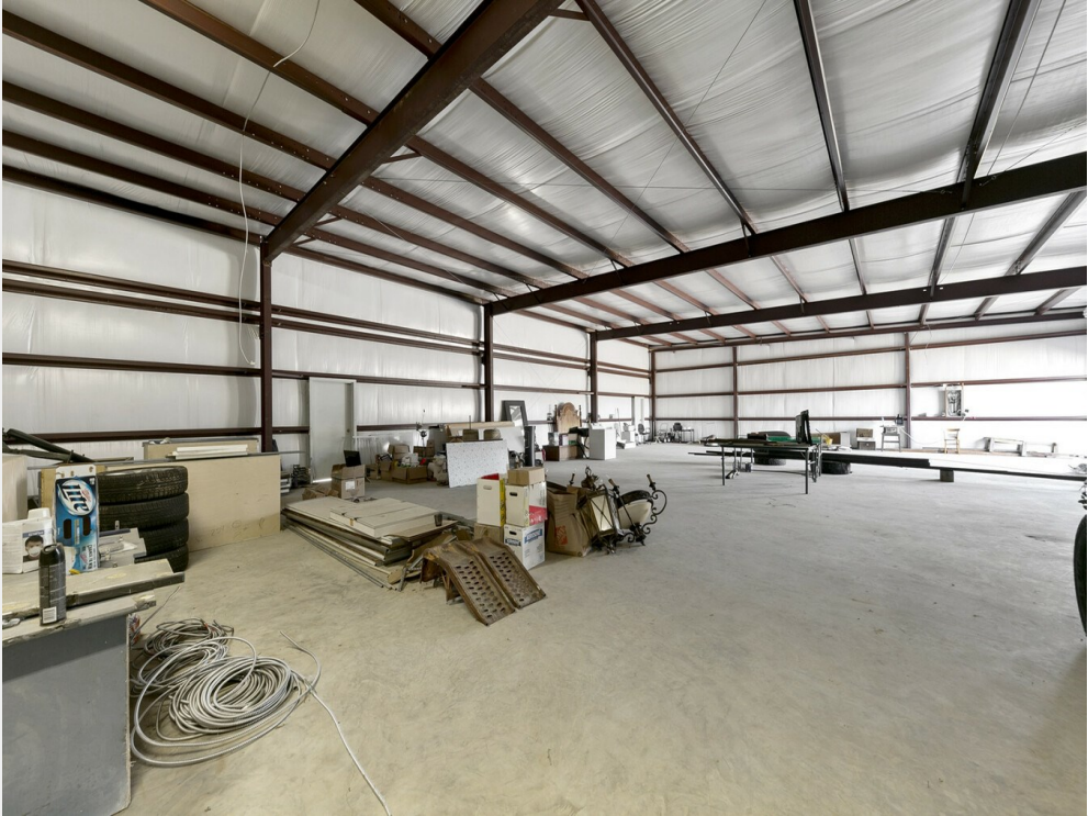
17175 highway 242-08