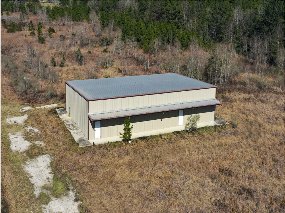
17175 highway 242-12