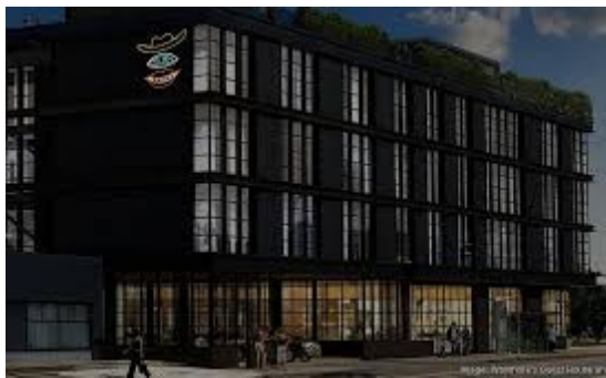
SOUTHERN LAND CO. / LINCOLN TECH. REDEVELOPMENT