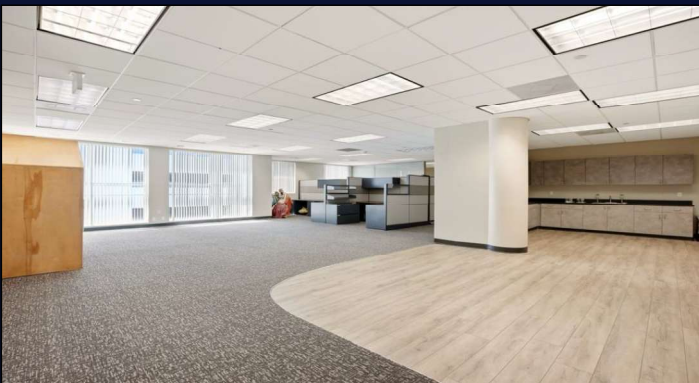
KITCHEN / BREAK ROOM