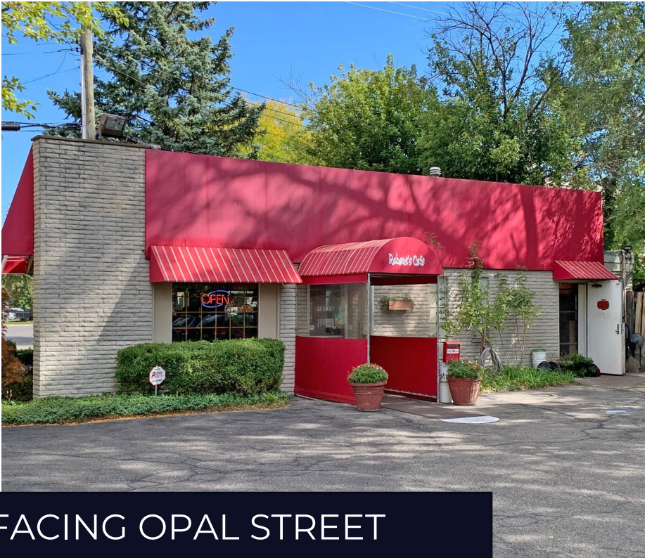
FACING OPAL STREET