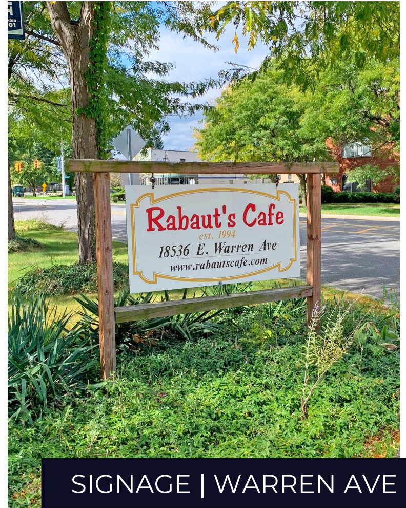
SIGNAGE | WARREN AVE