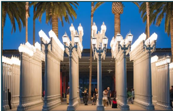
LOS ANGELES MUSEUM OF ART