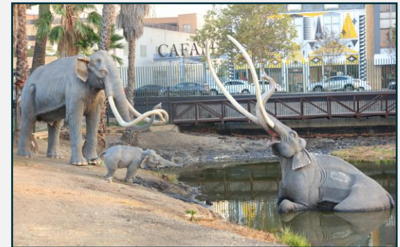
LA BREA TARPITS