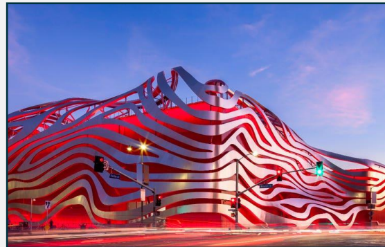
PETERSEN AUTOMOTIVE MUSEUM