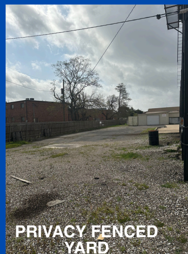
PRIVACY FENCED YARD