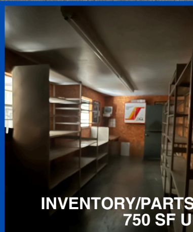
INVENTORY/PARTS/STORAGE/OFFICE 750 SF UPSTAIRS