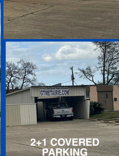
2+1 COVERED PARKING