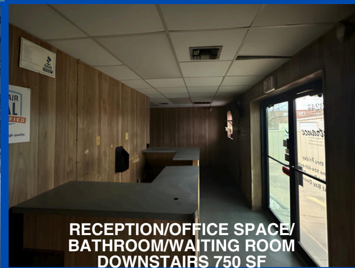
RECEPTION/OFFICE SPACE/ BATHROOM/WAITING ROOM DOWNSTAIRS 750 SF