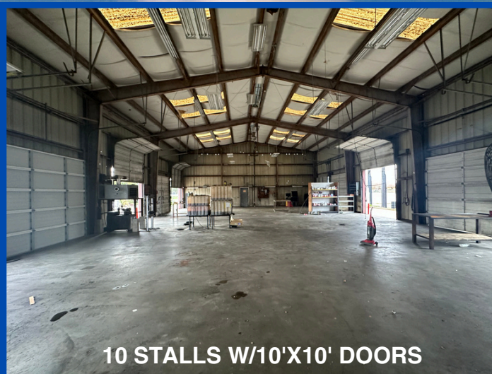
10 STALLS W/10'X10' DOORS