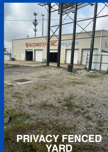
PRIVACY FENCED YARD