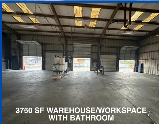
3750 SF WAREHOUSE/WORKSPACE WITH BATHROOM