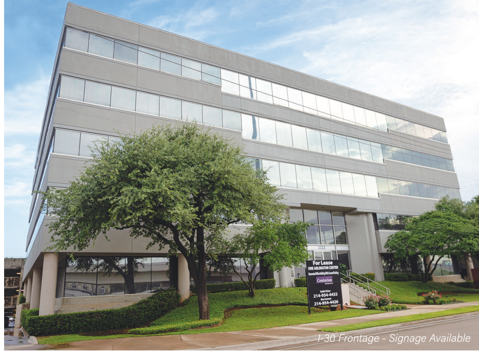
I-30 Frontage - Signage Available