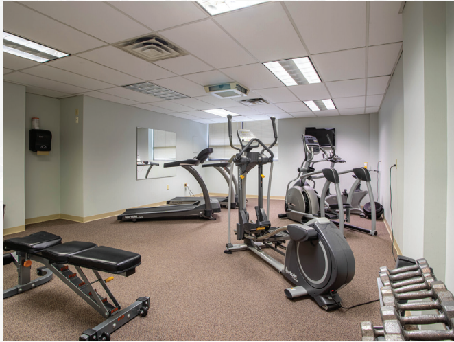
Newly Renovated Fitness Center