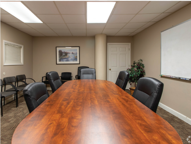
Shared Conference Room