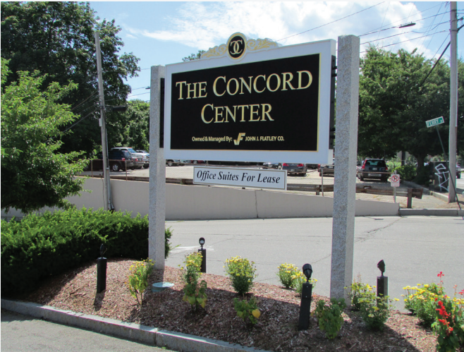
Visibility on Main Street