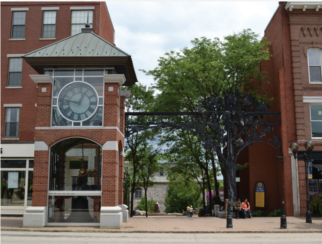
Walking Distance to Downtown Concord