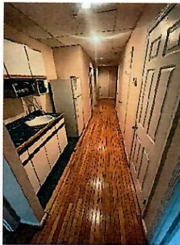
Kitchenette & hallway