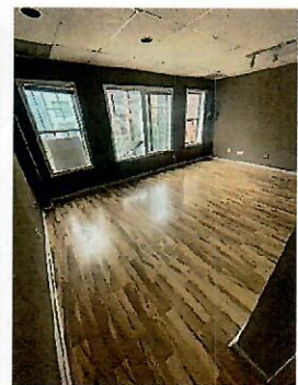
Office facing 2 nd Ave.

IMPROVEMENTS/PARKING: Very attractive unit facing 2 nd Avenue and easily accessible right off the elevator! This unit is divided up into 3 - 4 offices, reception area, kitchenette, 1/2 bath and more. The common hallways and offices have either hardwood or laminate flooring. 24/7 access and control of your own HVAC. The unit has its own separate heat pump, air handler, water heater and electric meter. Very attractive and comfortable appearance. Ready for immediate occupancy. The trash dumpster is located in the rear of the parking area. Ideal for an owner user, as the space will be vacant at settlement. This sale includes 1 covered parking space in the complex, space P-14.