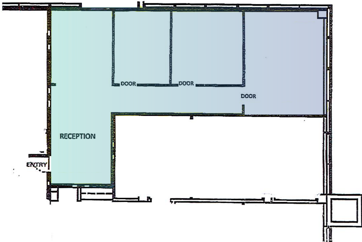
SUITE 240 - 1,088± SF