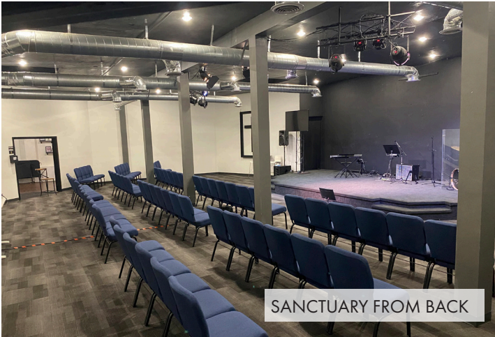
SANCTUARY FROM BACK