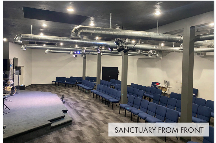
SANCTUARY FROM FRONT