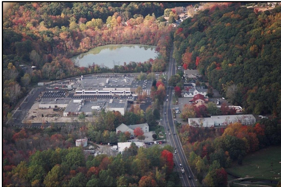
A View of Pond's Edge Professional Park

Centrally located in Connecticut's Fairfield County, Ridgefield is home to 9,000 households and 25,000 of the county's most affluent and best-educated residents. The town encompasses 35 square miles, has an extraordinary school district and has been named Connecticut's safest municipality on numerous occasions. Ridgefield has easy access to New York City by train or car and is a short one-hour drive from Hartford. Ridgefield is a cultural powerhouse rich in history, entertainment venues, culinary delights, bustling businesses, and shopping experiences. According to a 2018 study from Yankee Institute, it ranks as Connecticut's fourth most business-friendly town, and Connecticut Magazine recently called it a town with "cosmopolitan culture in a country setting."