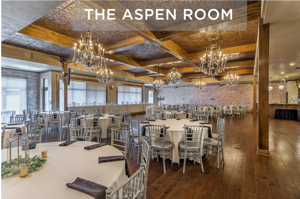
THE ASPEN ROOM