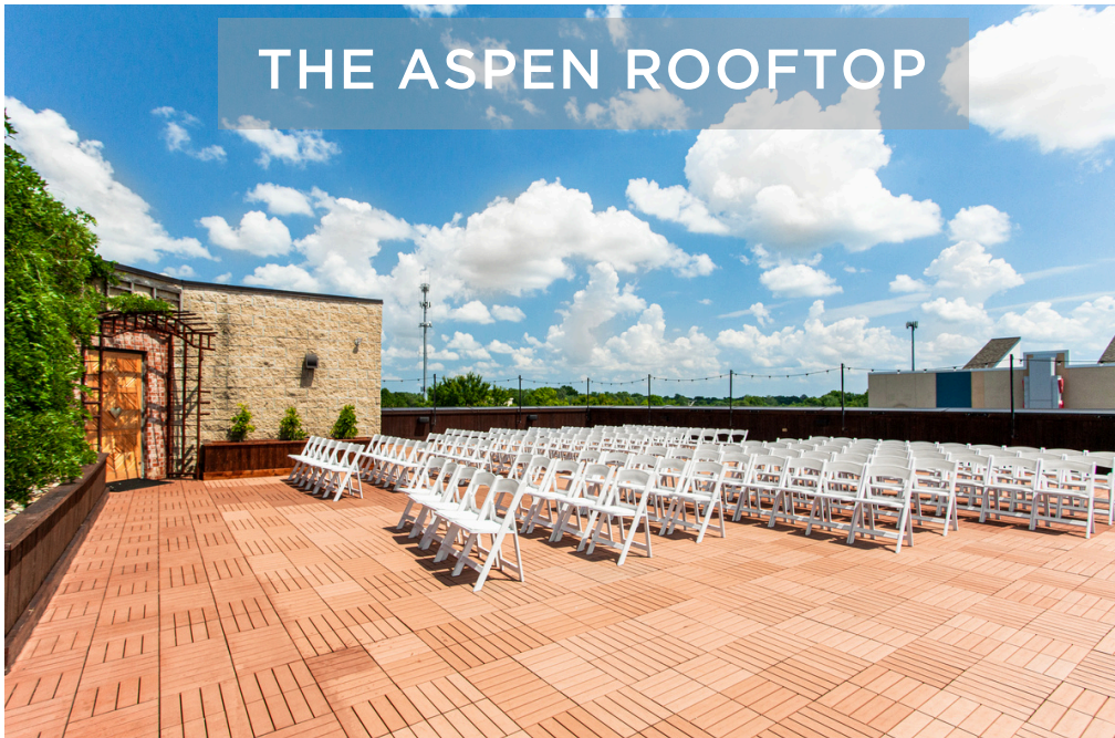
THE ASPEN ROOFTOP