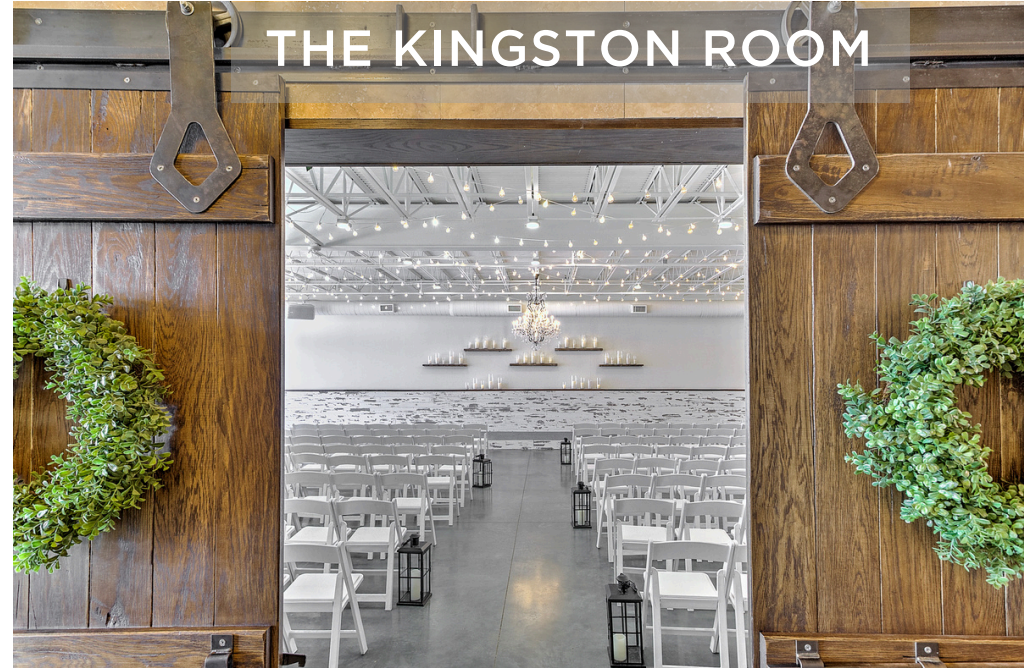
THE KINGSTON ROOM