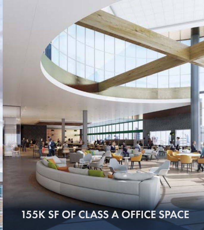
155K SF OF CLASS A OFFICE SPACE