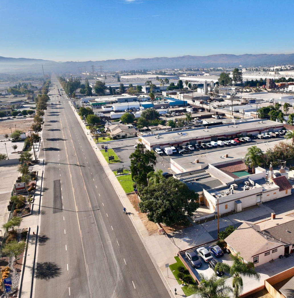
Opportunity for signage visibility on Central Avenue