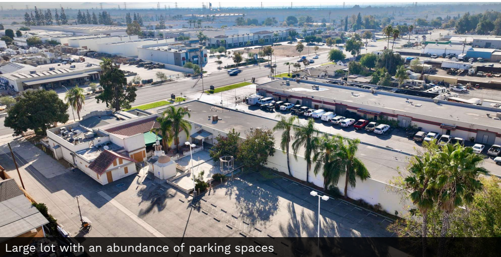
Large lot with an abundance of parking spaces