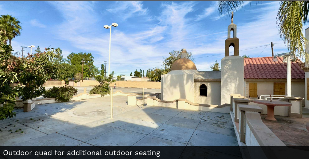
Outdoor quad for additional outdoor seating