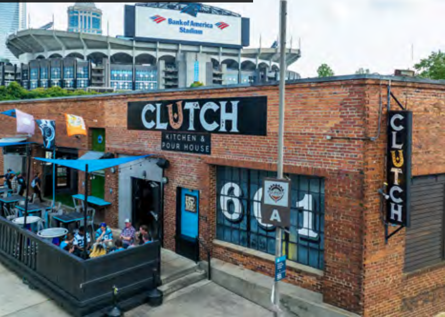
On-Site Restaurant & Bar