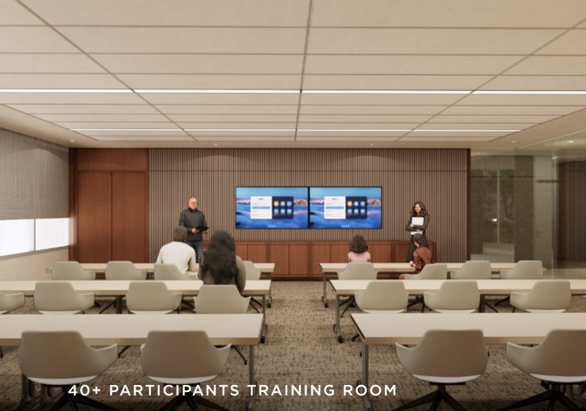
40+ PARTICIPANTS TRAINING ROOM