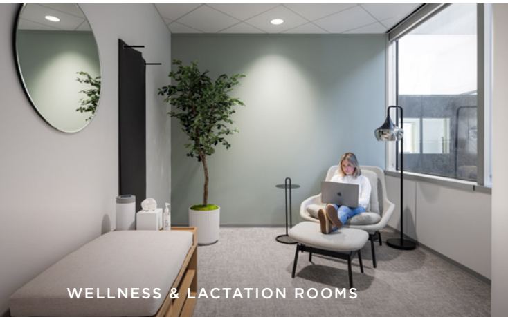
WELLNESS & LACTATION ROOMS