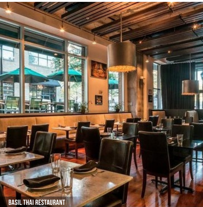
BASIL THAI RESTAURANT