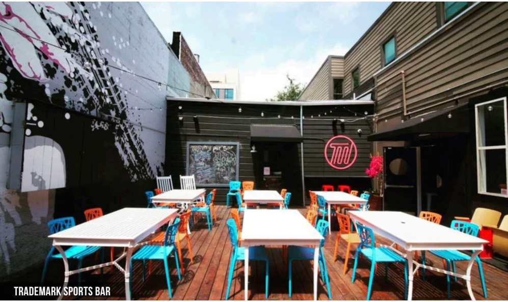
TRADEMARK SPORTS BAR