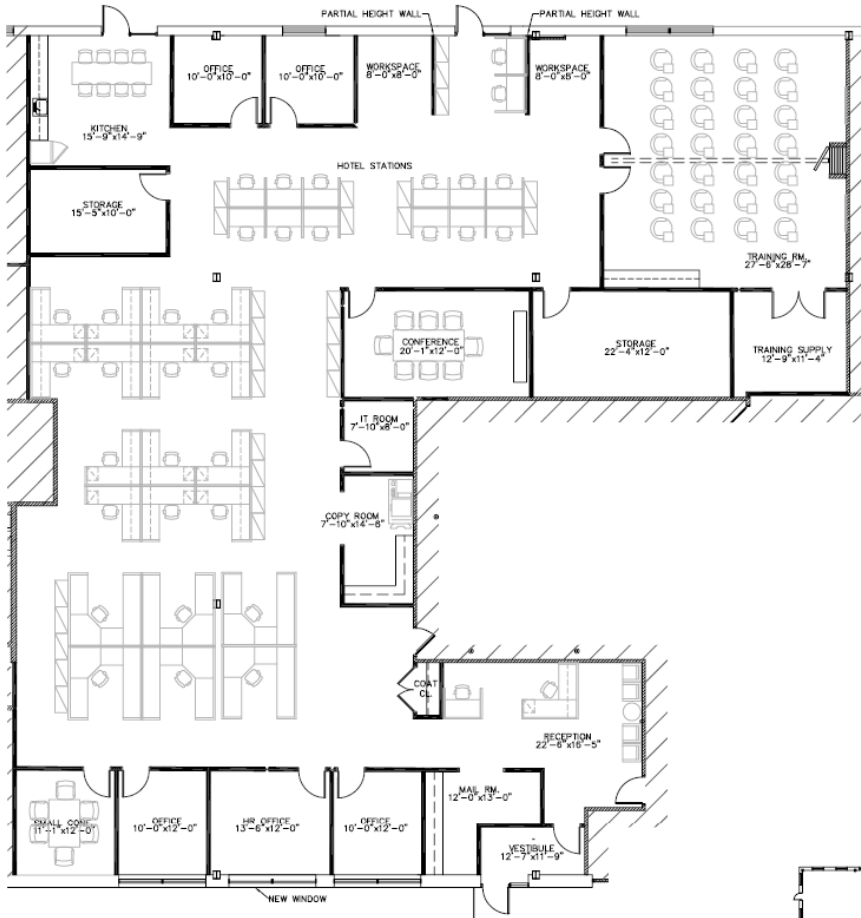
FIRST FLOOR SPACE PLAN