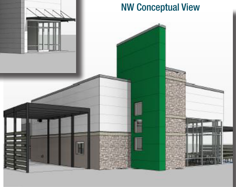
NW Conceptual View

The information above has been obtained from sources believed reliable but is not guaranteed. It is your responsibility to independently confirm its accuracy and completeness. 3/28/2024