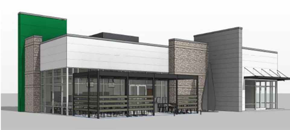
NE Conceptual View