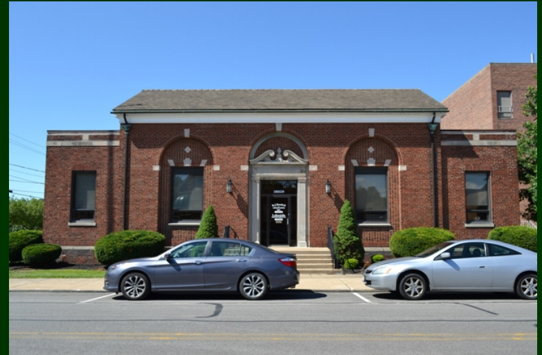
38029 3 rd St., Willoughby, OH

No warranty or representation, express or implied, is made as to the accuracy of the information contained herein. It is submitted subject to errors, omissions, price changes, rental or other conditions, withdrawal without notice, and to any special listing conditions imposed by our client.