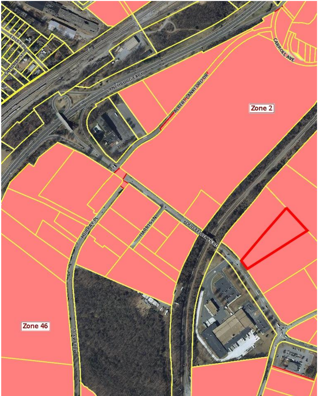
Enterprise Zone 3327 Odd Fellows Road Lynchburg, VA