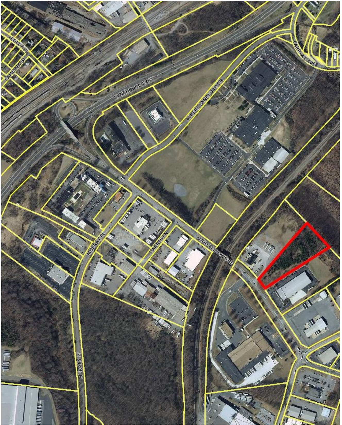
3327 Odd Fellows Road Lynchburg, VA