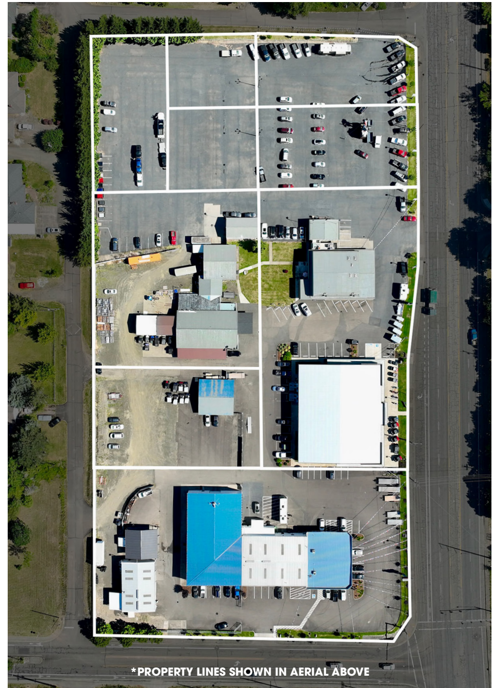
*PROPERTY LINES SHOWN IN AERIAL ABOVE