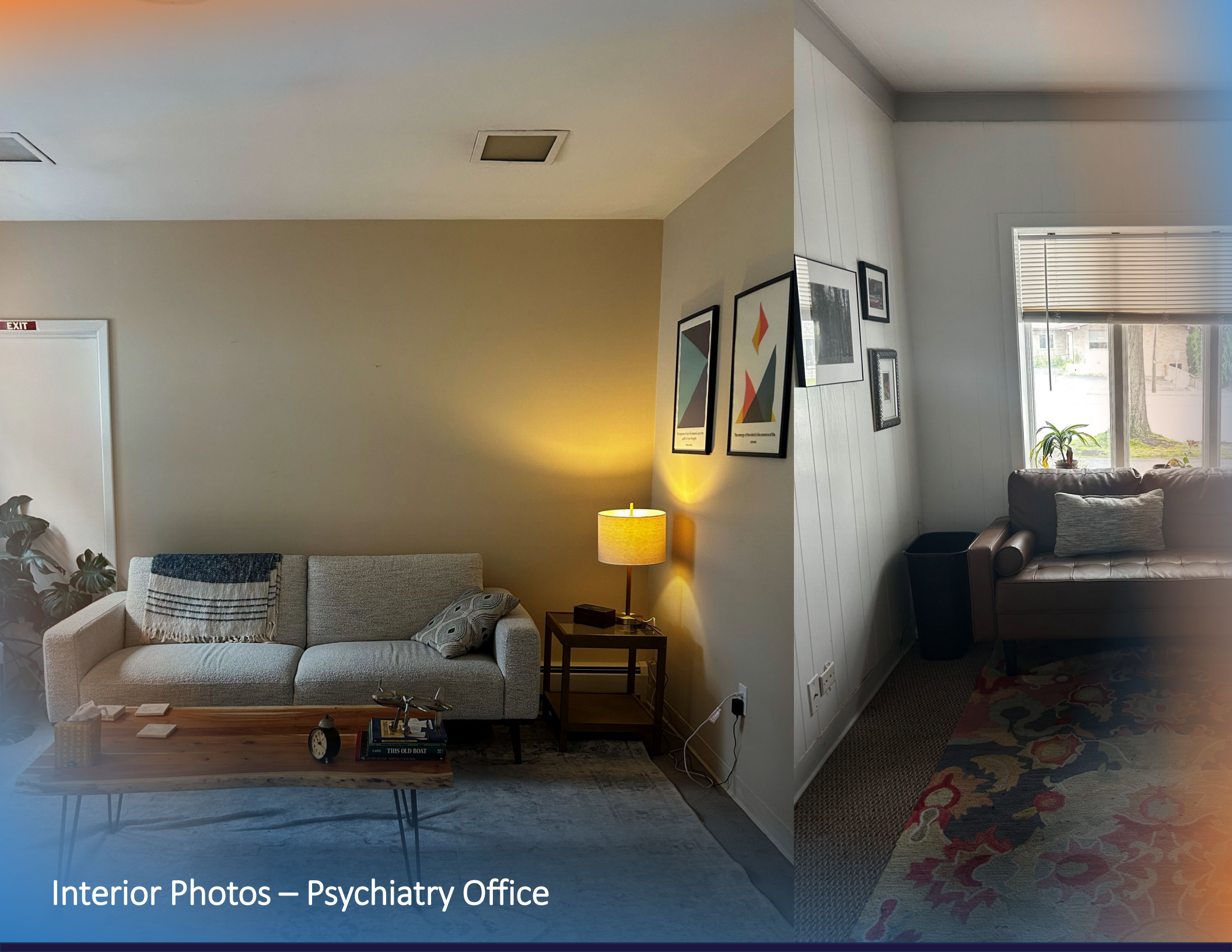
Interior Photos – Psychiatry Office