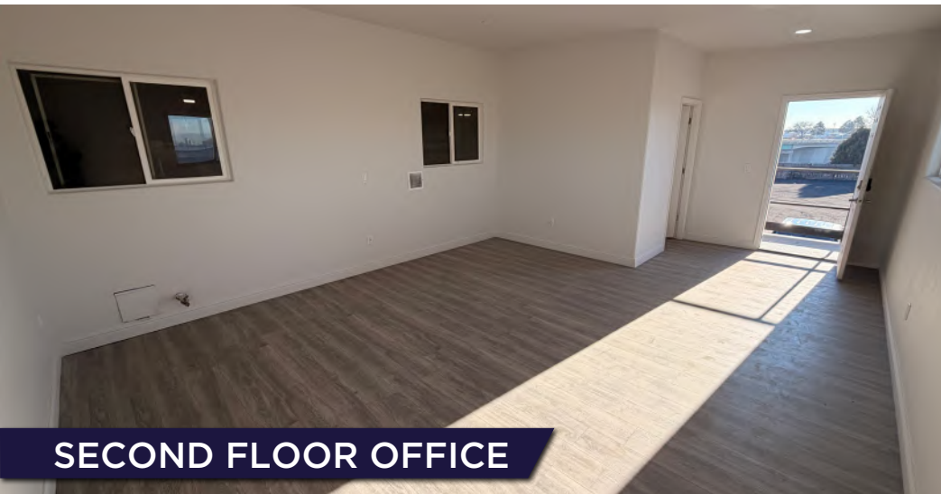
SECOND FLOOR OFFICE