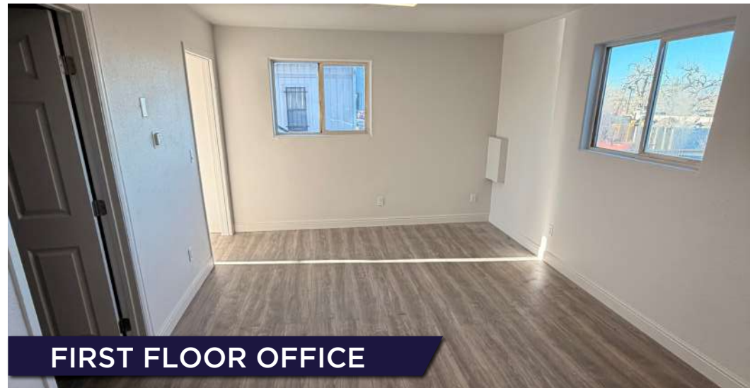
FIRST FLOOR OFFICE

For More Information Please Contact Our Team: