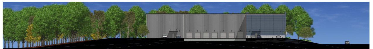
SOUTH ELEVATION - SCALE: 1/16" = 1'-0"