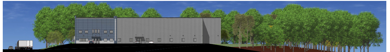
NORTH ELEVATION - SCALE: 1/16" = 1'-0"