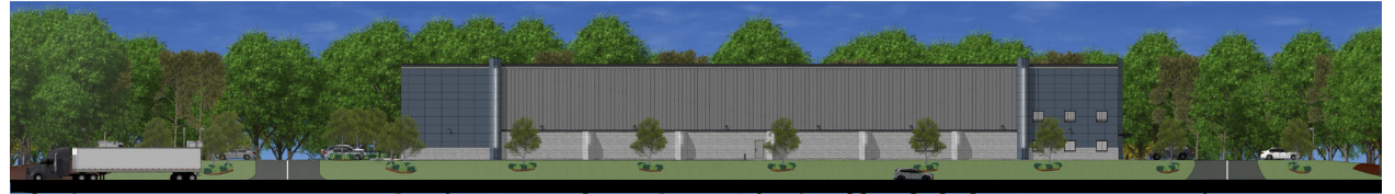
EAST ELEVATION - SCALE: 1/16" = 1'-0"