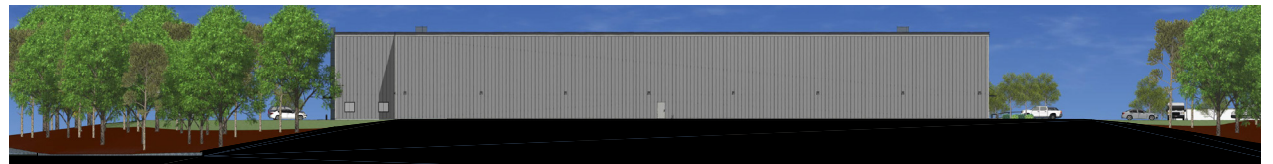
WEST ELEVATION - SCALE: 1/16" = 1'-0"