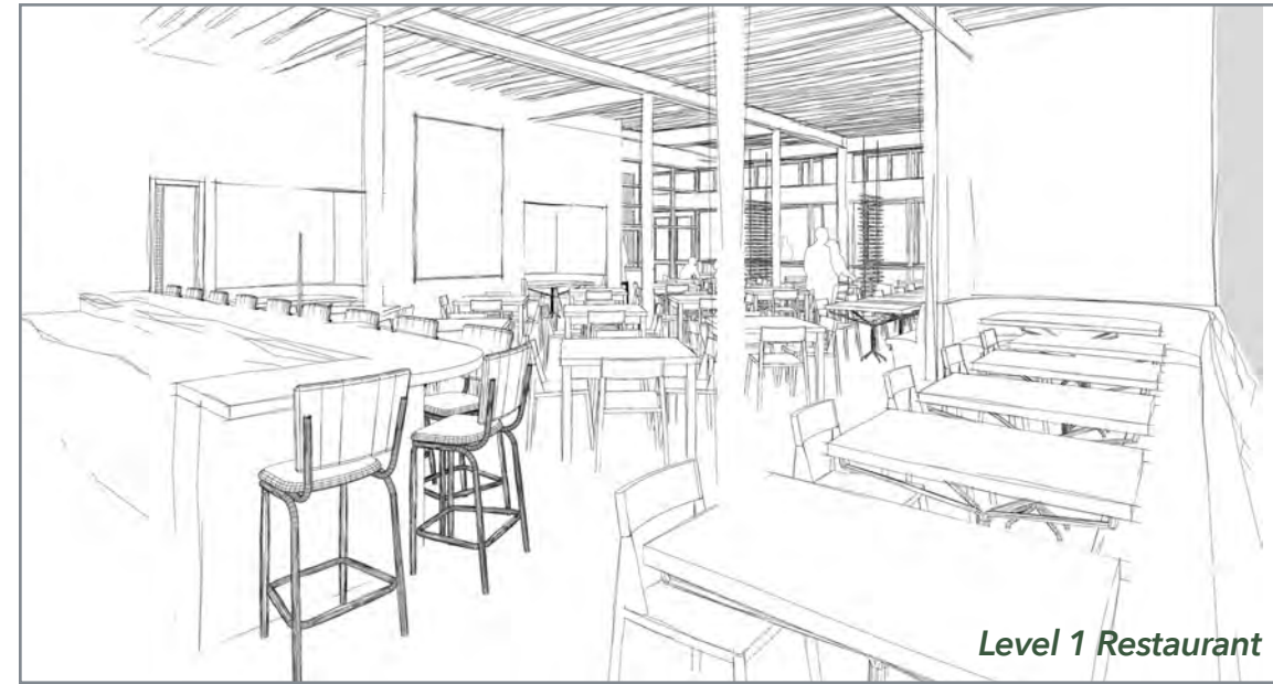
Level 1 Restaurant