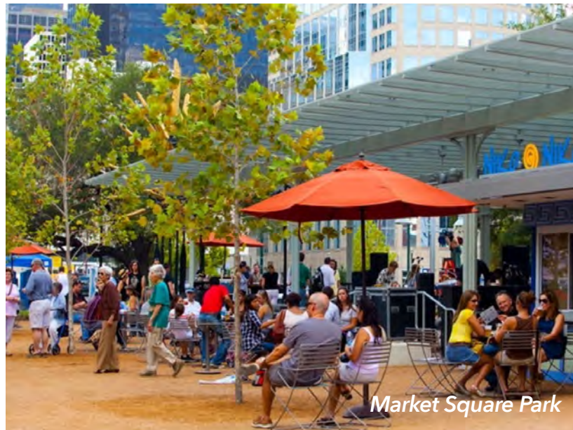
Market Square Park