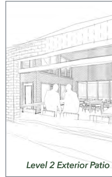
Level 2 Exterior Patio