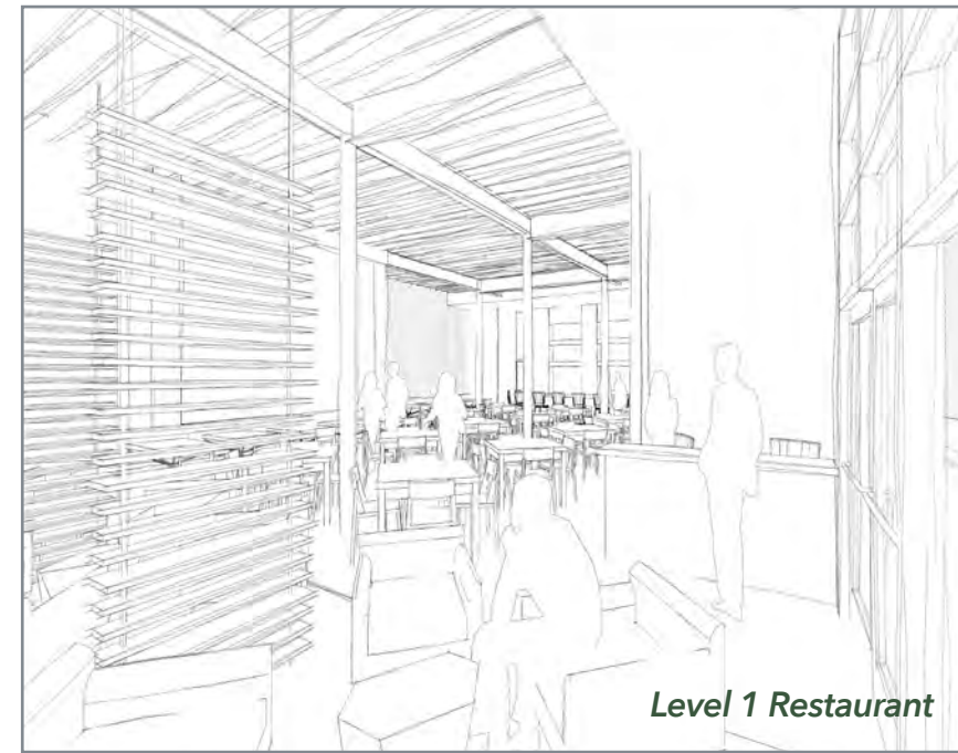
Level 1 Restaurant