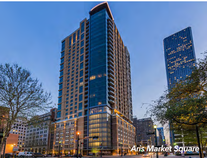
Aris Market Square