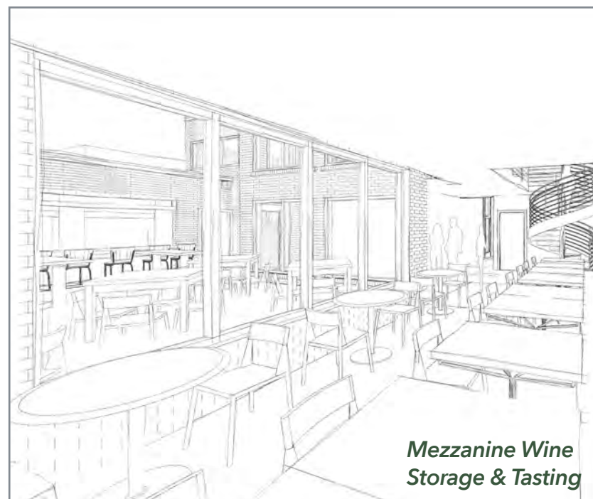
Mezzanine Wine Storage & Tasting