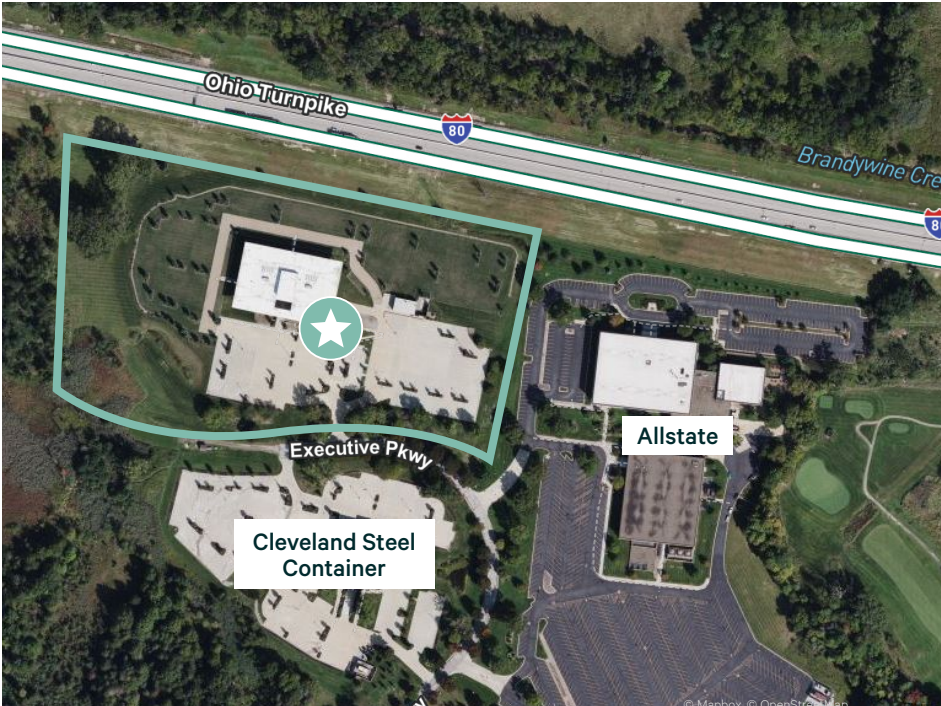
Property Aerial — 500 feet of frontage along I-80