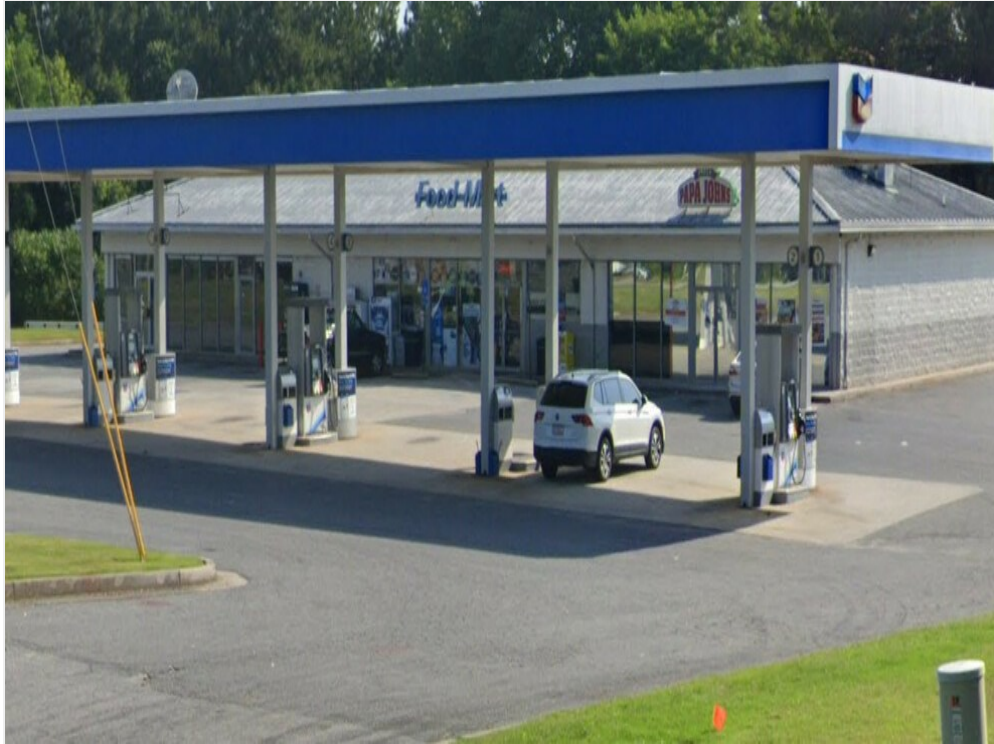
Photo of Property