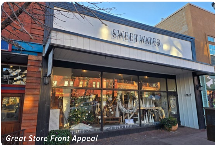
Great Store Front Appeal