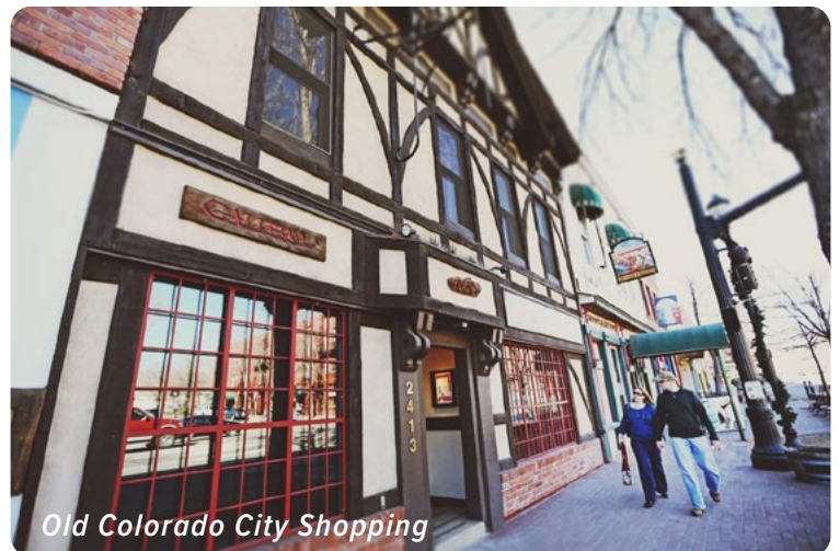
Old Colorado City Shopping