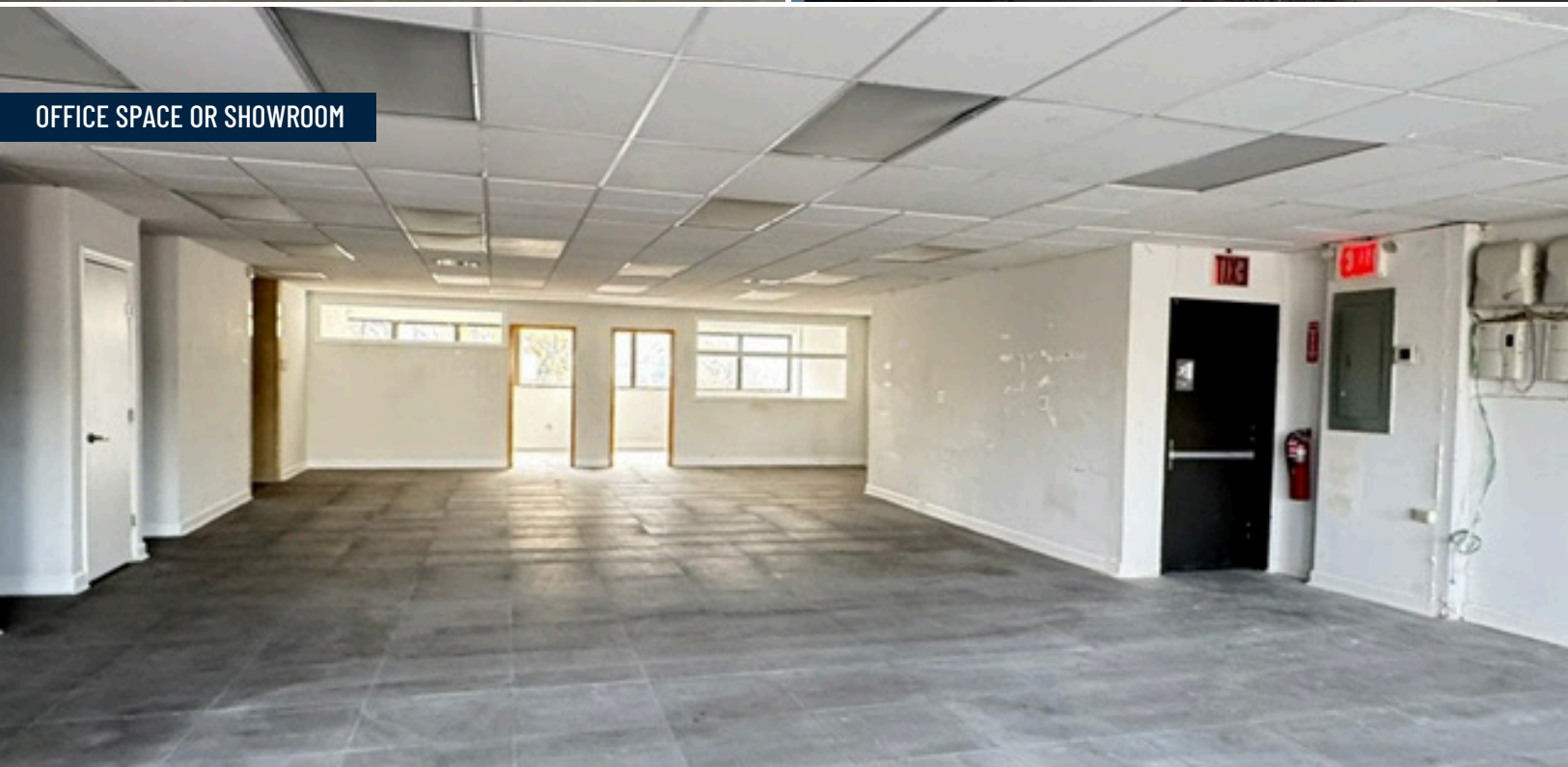
OFFICE SPACE OR SHOWROOM