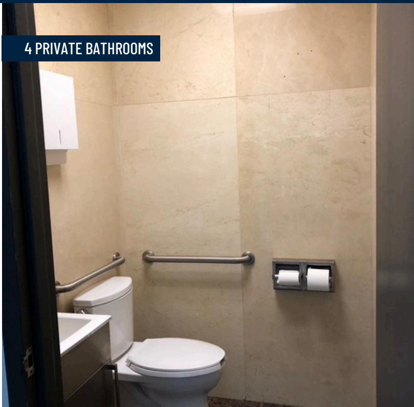
4 PRIVATE BATHROOMS