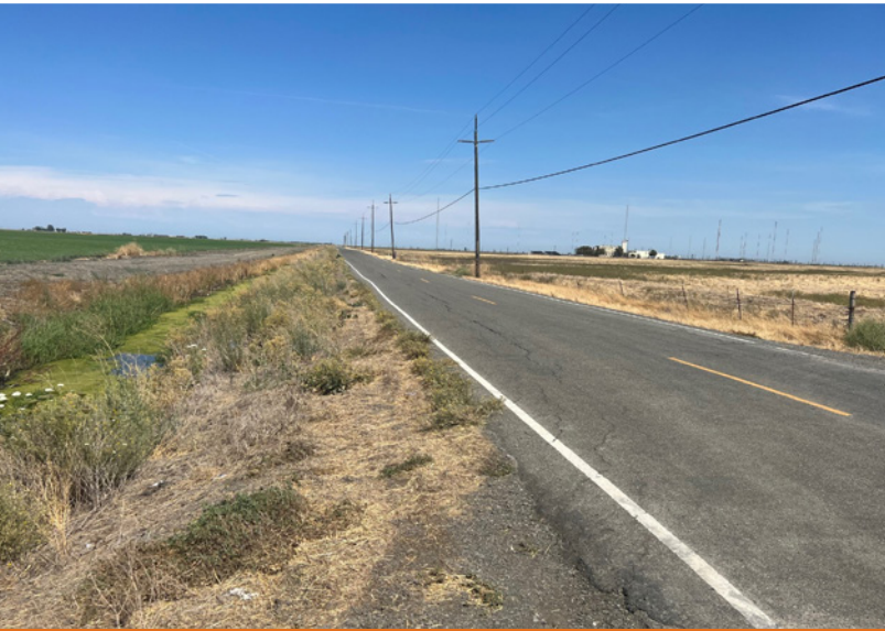
View E along Radio Station Rd. frontage