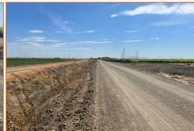
Misc. View down E. Boundary from NEC