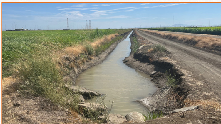
View Down Ditch Along W. Boundary