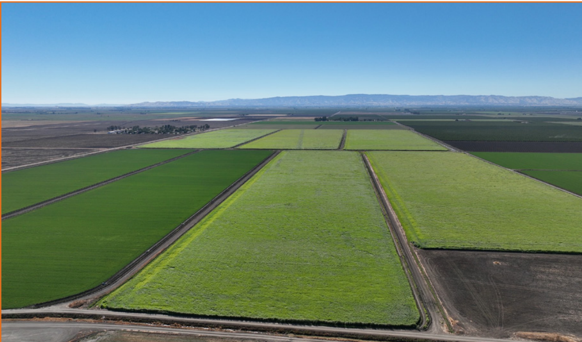
Aerial View W from E. Boundary