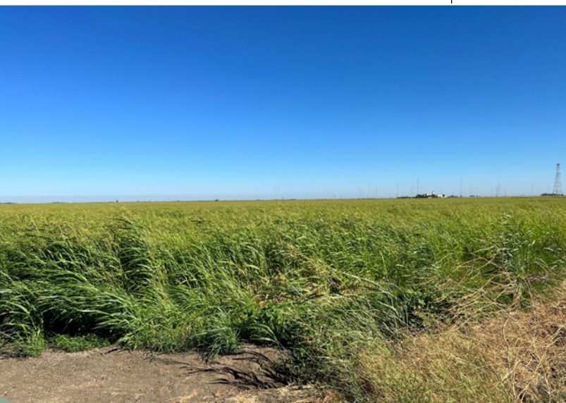
View of Sudan Grass Field from NWC