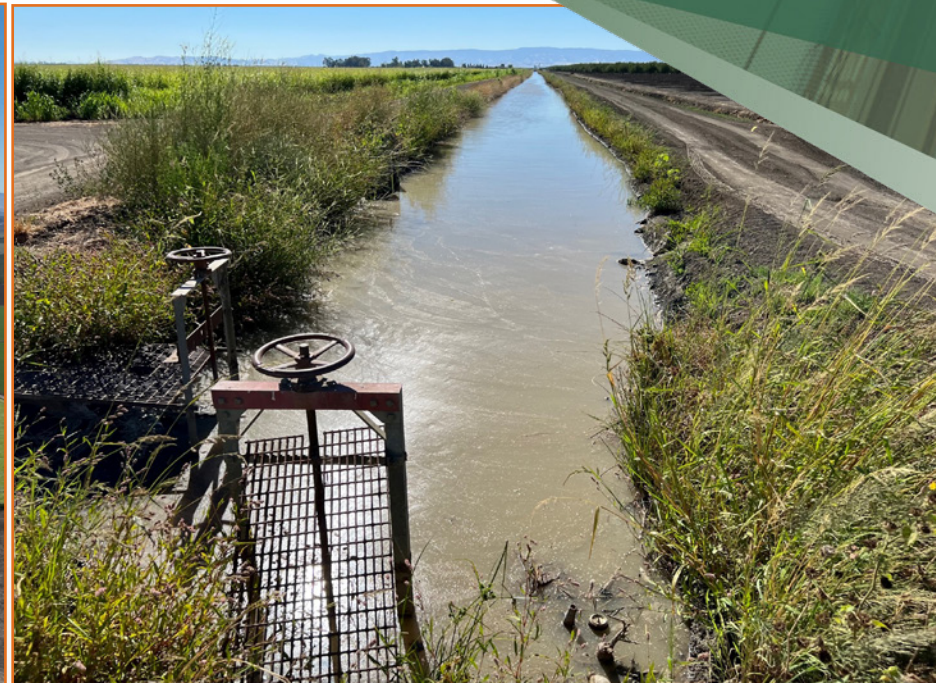
RD 2068 Irrig. Canal Turn-Out Gate