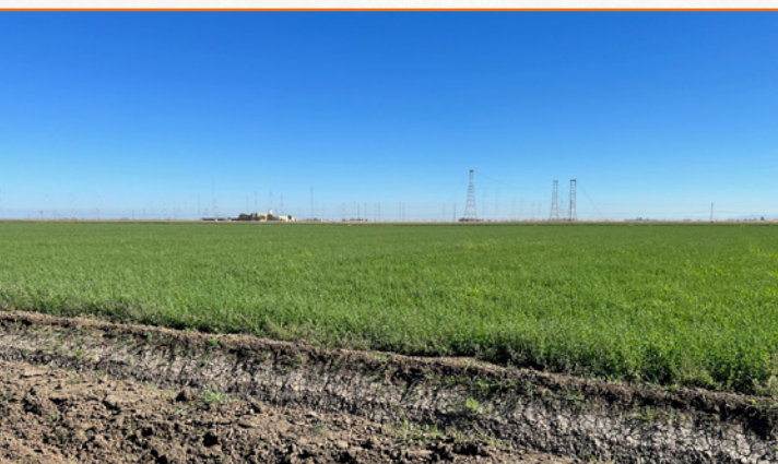
Standing Alfalfa Looking South