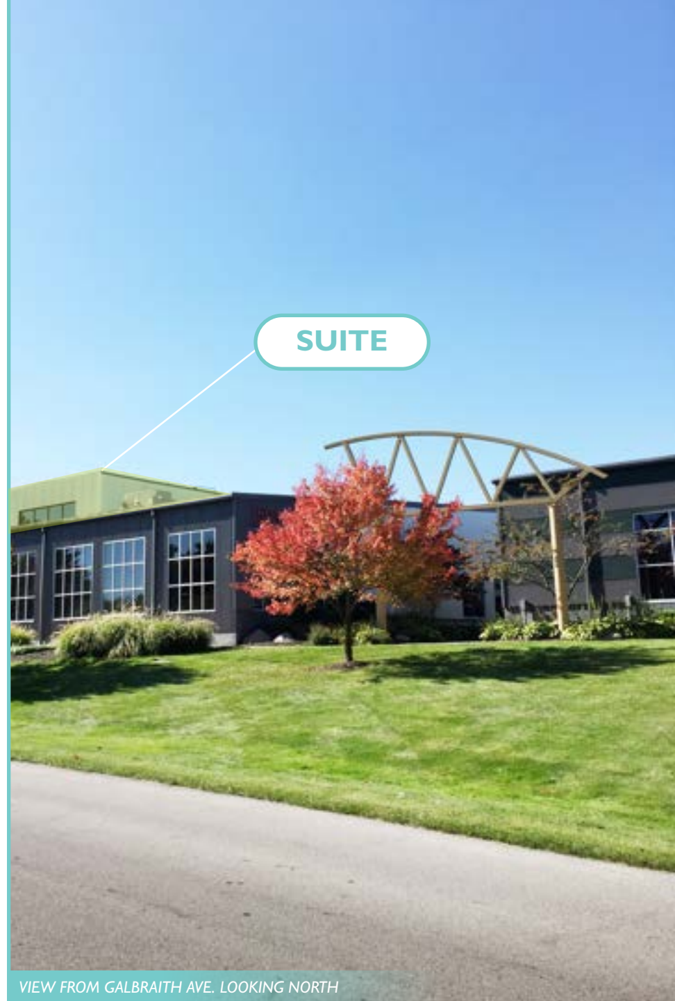
VIEW FROM GALBRAITH AVE. LOOKING NORTH