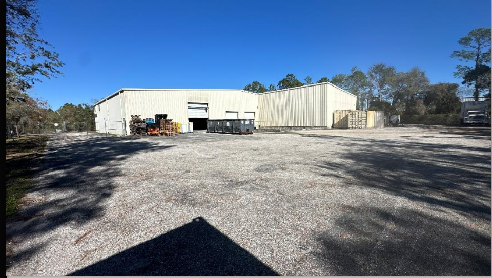
Outdoor Storage for Laydown Yard or Truck Parking in Rear

Other Notable Characteristics: Fully Climate-Controlled and Clear Span Warehouse