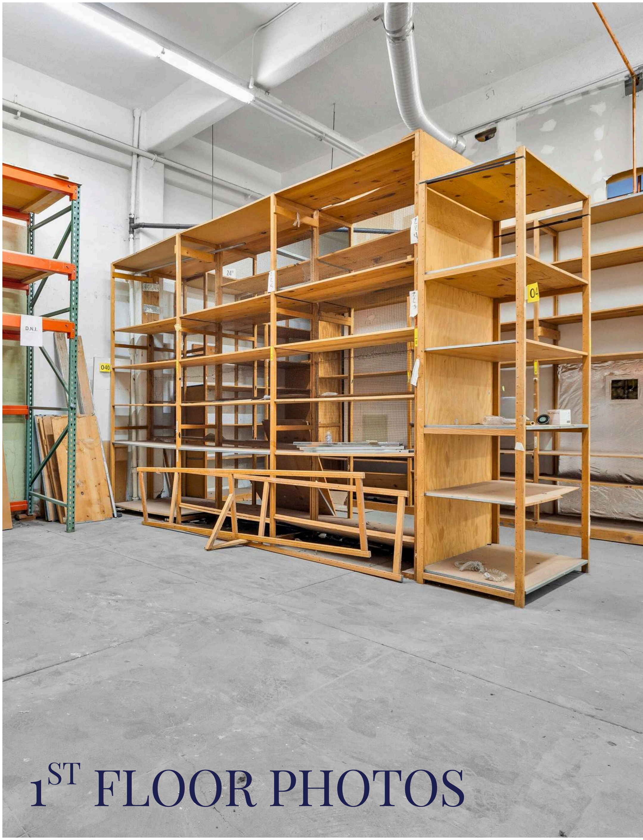
1 ST FLOOR PHOTOS