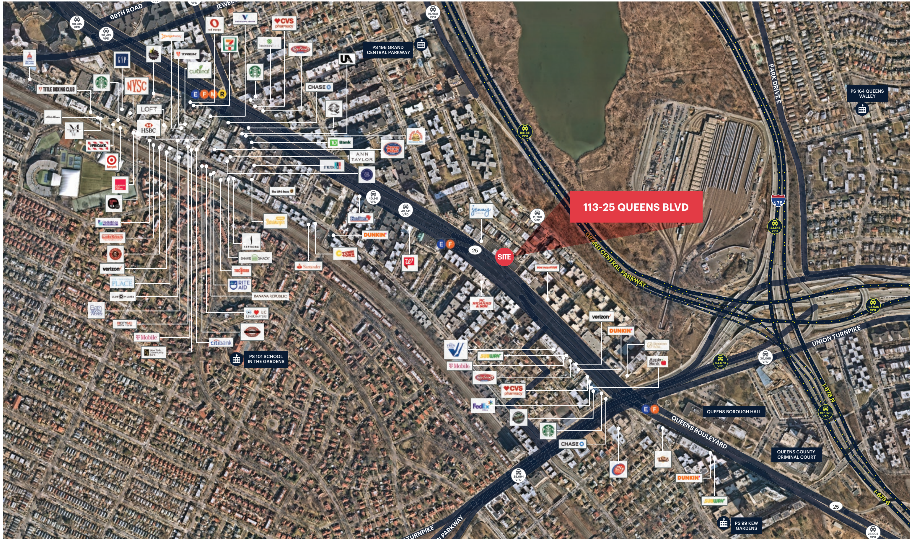
113-25 QUEENS BLVD FOREST HILLS, NEW YORK