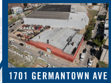
1701 GERMANTOWN AVE