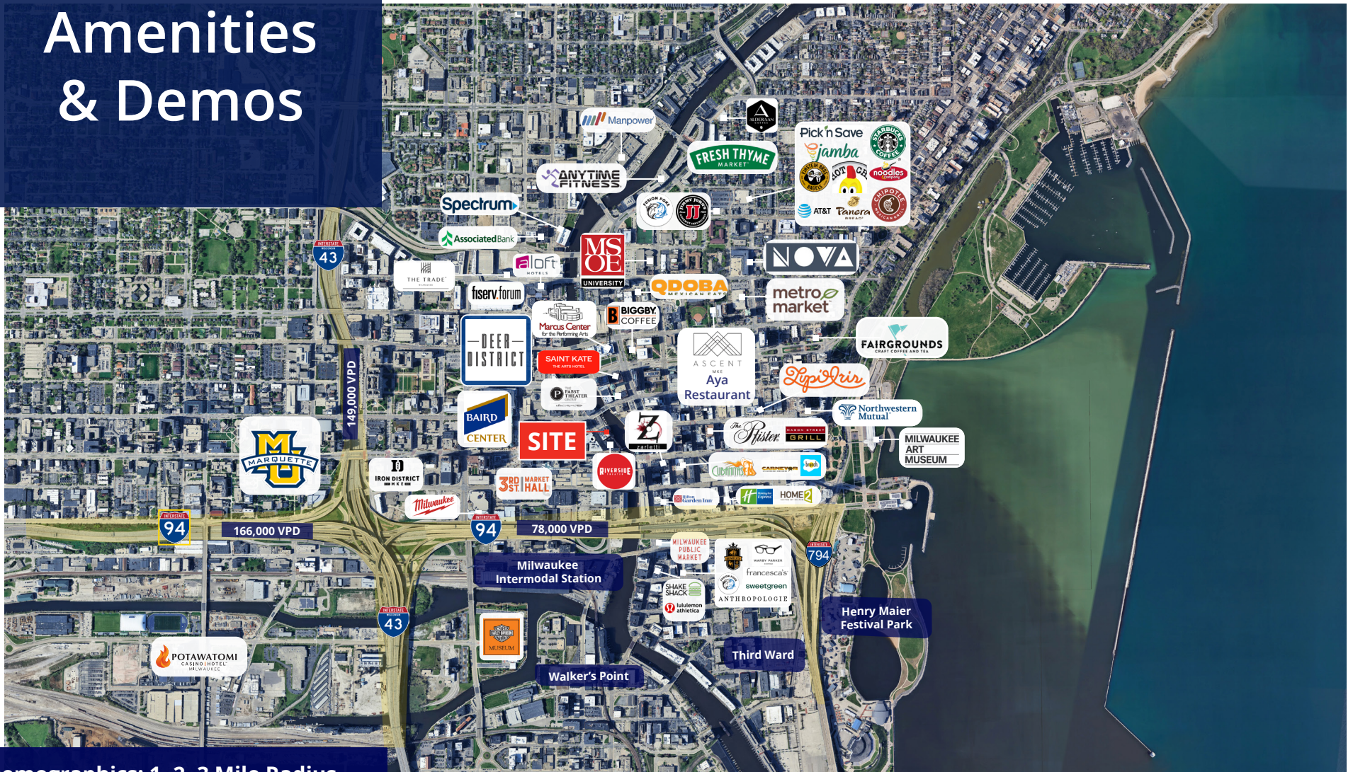
Demographics: 1, 2, 3 Mile Radius