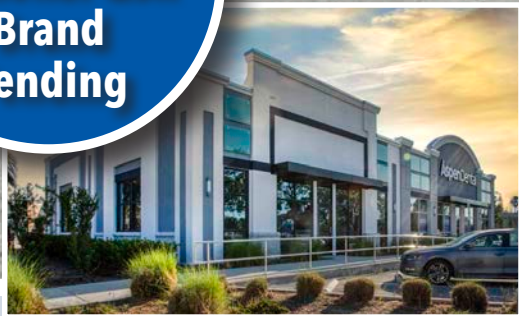
2,500 SF Endcap

NOTE: Lease with National QSR Brand Pending