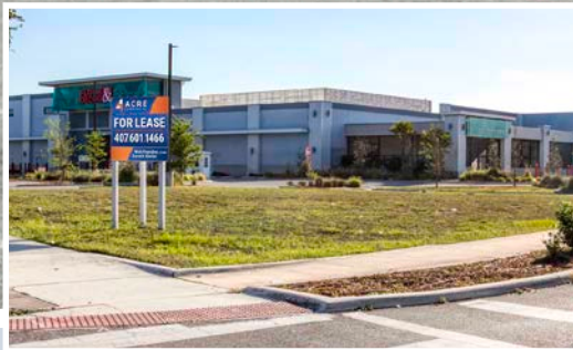
5,697 SF PAD 1