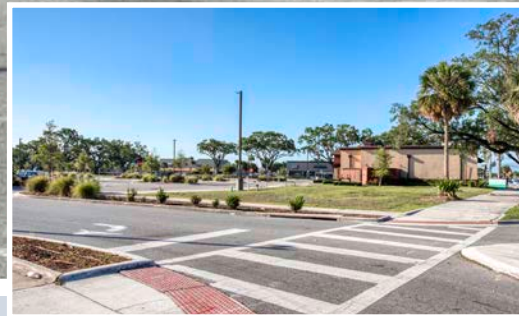
4,508 SF PAD 5