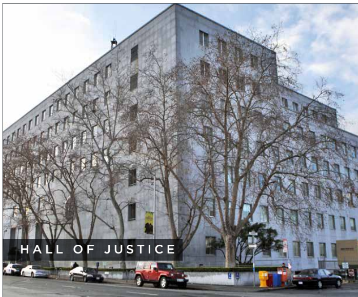
HALL OF JUSTICE