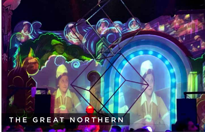
THE GREAT NORTHERN