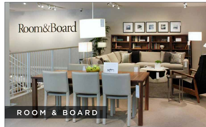
ROOM & BOARD