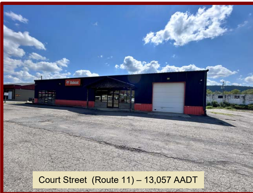
Court Street (Route 11) – 13,057 AADT

596 Upper Court Street Binghamton, NY 13904 Broome County