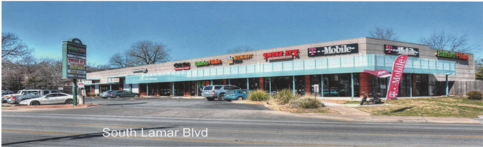
South Lamar Blvd