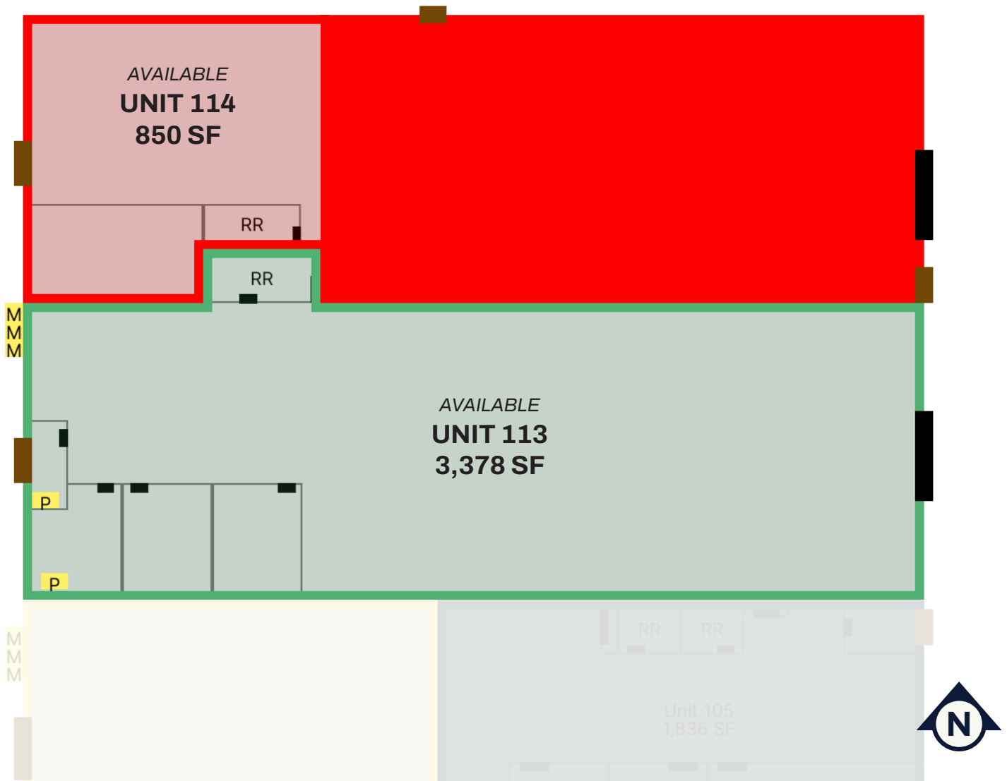
FLOOR PLAN – AVAILABLE UNITS 113 & 114