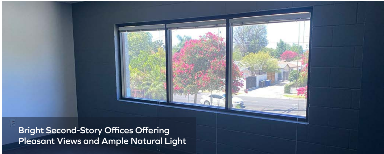
Bright Second-Story Offices Offering Pleasant Views and Ample Natural Light