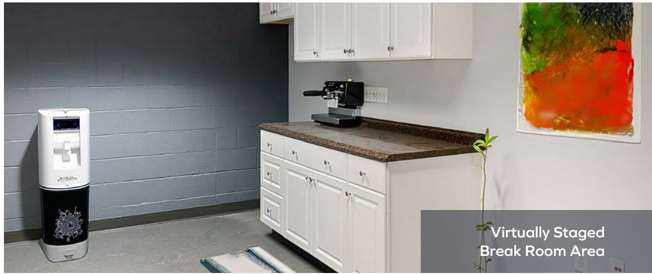
Virtually Staged Break Room Area